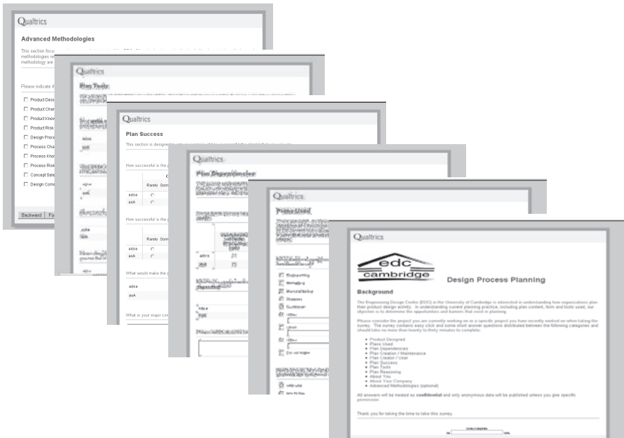
Figure 3. Screens in the design planning survey